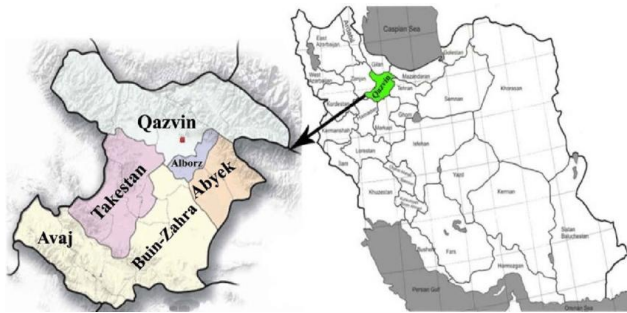
[Fig.1: The Location of Qazvin City in Iran Map]

The research focuses on Qazvin, a city in northwestern Iran, which faces significant challenges in water supply management due to rapid urbanization, population growth, and climate change (Figure 1). The existing water supply infrastructure is characterized by inefficiencies, high levels of water loss, and inadequate service delivery, making it an ideal context for exploring the feasibility of smart water supply systems.