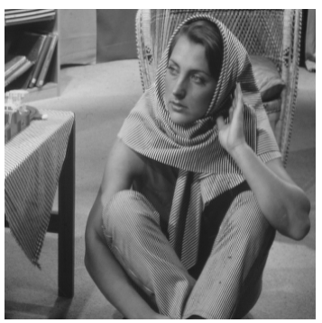
Fig. (C) A 341 x 341 I/P Image

For resizing of YUV videos, a YUV video is given as an input along with resizing ratio. Each frame of the input video is resized according to the given resizing ratio. The input video is resized by the implemented approach and the existing YUV tool by the same input resizing ratio. And PSNR values are calculated for both between the resized and original video which are given subsequently: