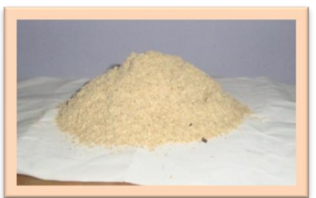
FIGURE 3: GROUND NUT SHELL

Groundnut shell is an agricultural waste obtained from milling of groundnut. The ash from groundnut shell has been categorized under pozzolana, with about 8.66% Calcium Oxide (CaO), 1.93% Iron Oxide (Fe<sub>2</sub>O<sub>3</sub>), 6.12% Magnesium Oxide (MgO), 15.92% Silicon Oxide (SiO<sub>2</sub>), and 6.73% Aluminium Oxide (Al<sub>2</sub>O<sub>3</sub>). The utilization of this pozzolana as a replacement for traditional stabilizers will go a long way in actualizing the dreams of most developing countries of scouting for cheap and readily available construction materials.