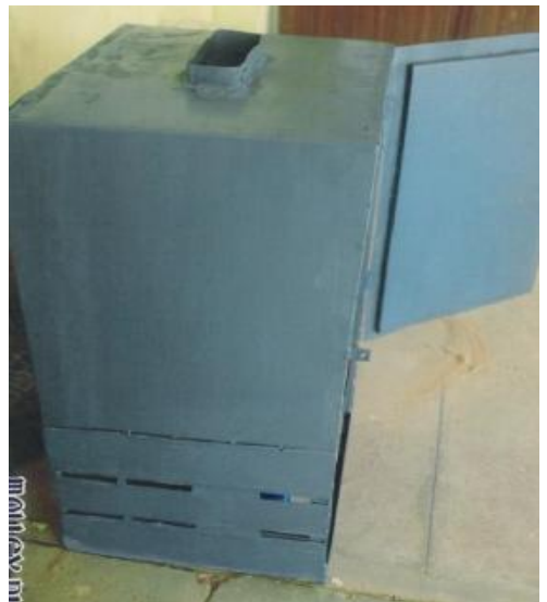
Fig. 2: Side view of the yam chips dryer

Published By: Blue Eyes Intelligence Engineering & Sciences Publication