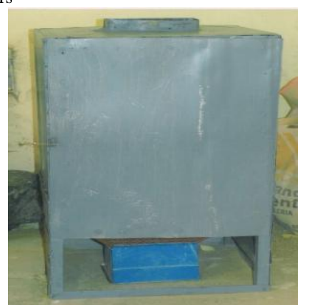
Fig. 1: Front view of the yam chips dryer